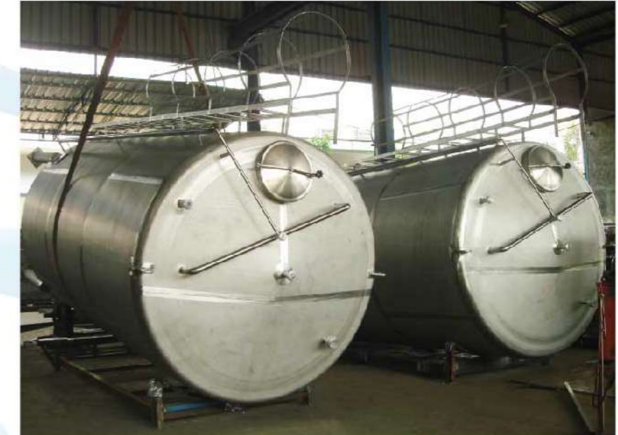
Storage Tank with CIP Spray Ball