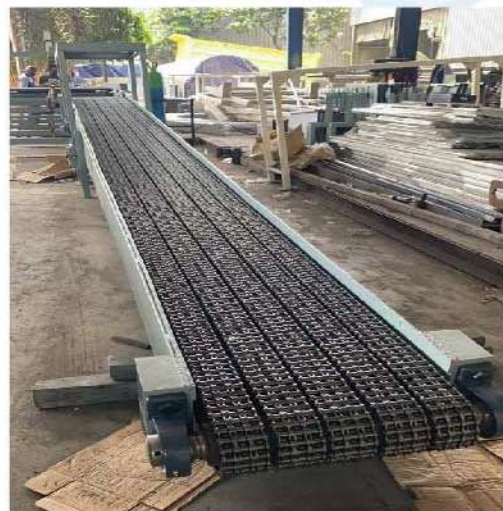
Heavy Forging Dies Part Chain Conveyor Automation