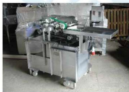
Crab Leg Cutting Machine