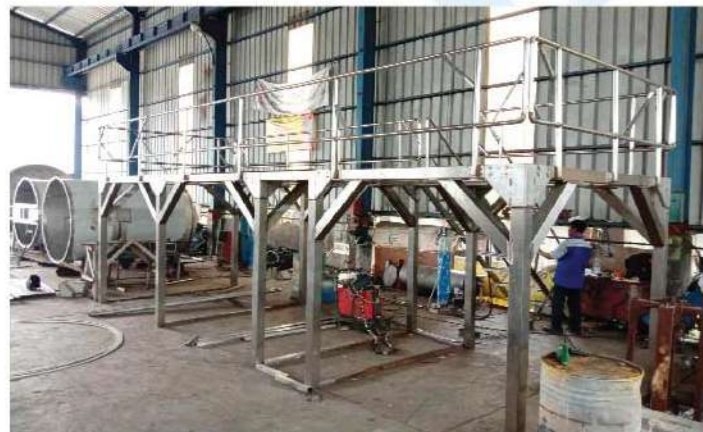
Platform for Multi Weigher Stainless Steel