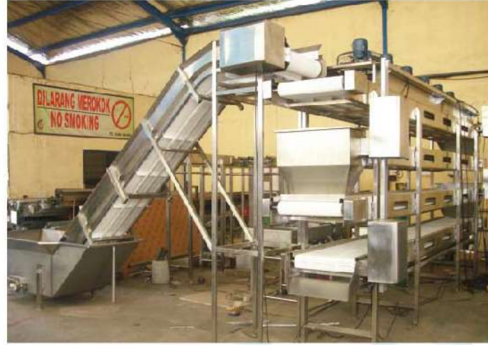
Multistage Cooling Conveyor