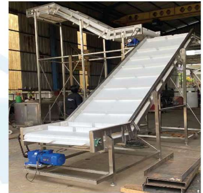
Conveyor Modular Output IQF