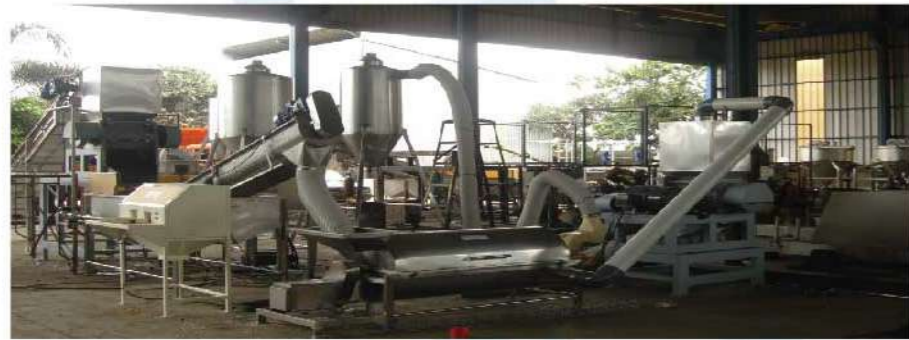
Bottle Crusher System