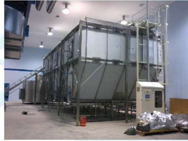
Storage Silo For Bottle