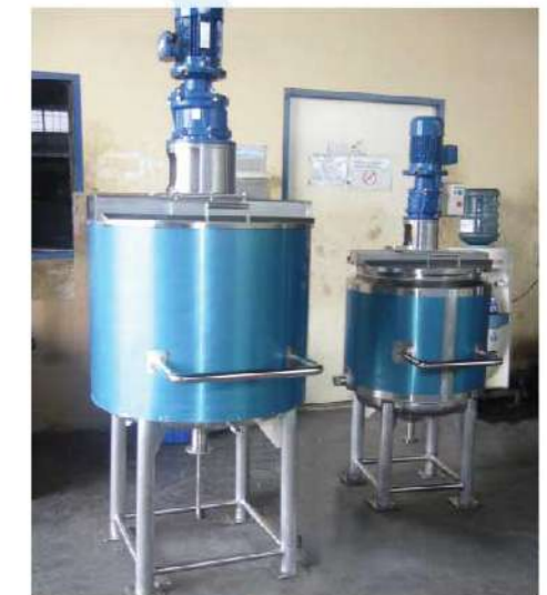
Portable Mixing Tank