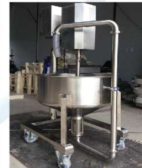
Forming Fish Ball Transfer Tank