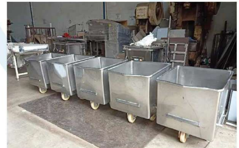
Meat Car Trolley