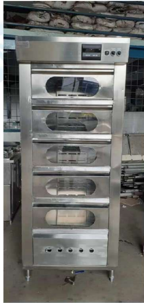
Proofer for Buns