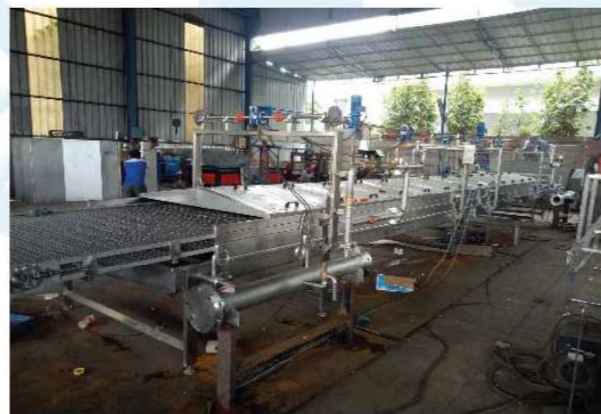
Chicken Steaming Conveyor System