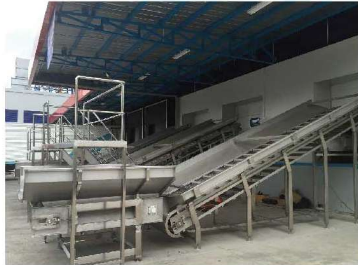
Unloading / Receiving Tuna Conveyor