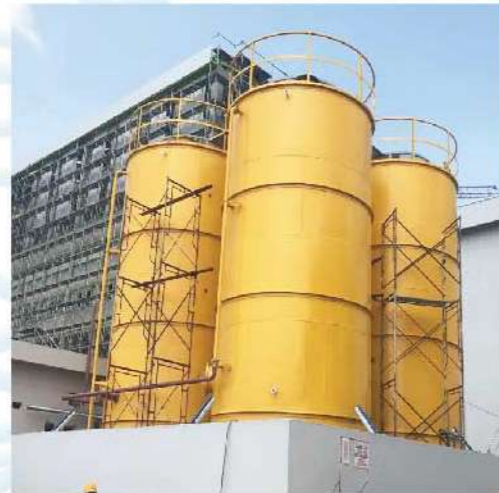
Ruber Oil Storage For Automation Company