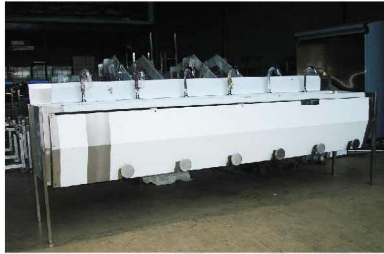
Hand Wash Basin Knee Pusher