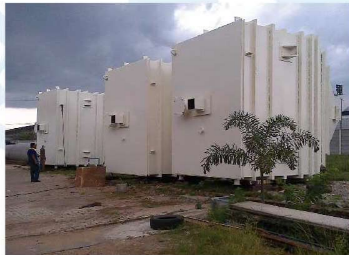
Storage Silo for Cocoa