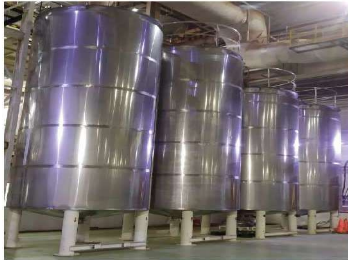
Double Jacket With Agitator Chocolate Storage Tank