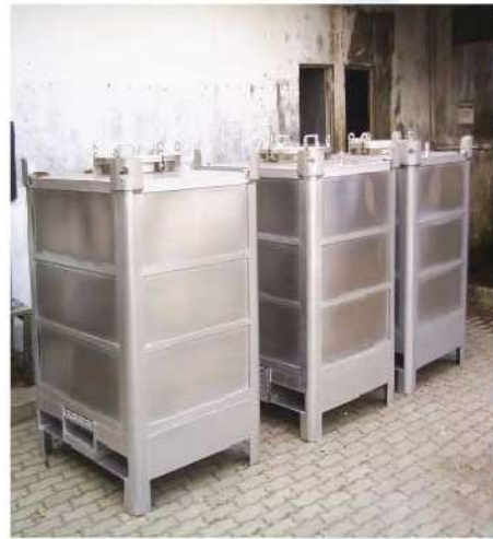
IBC Stainless Steel (Intermediate Bulk Containers)