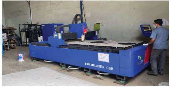
CNC Laser Cutting