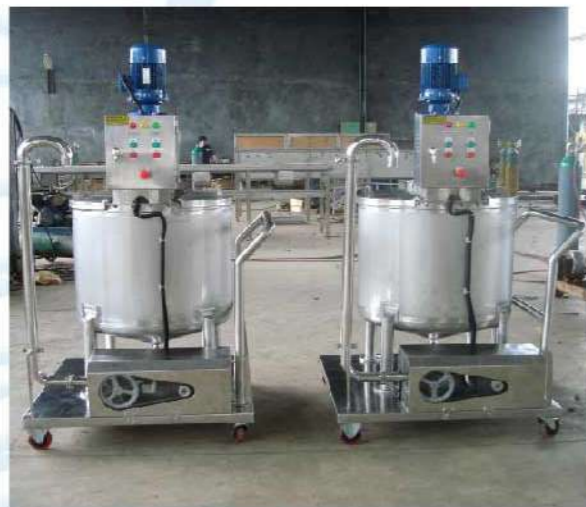
Mobile Portable Mixer (Chocolate Production)