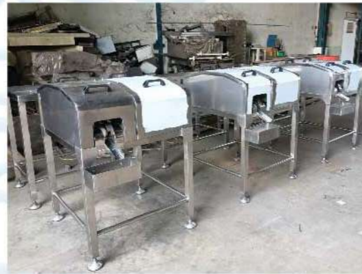
Sushi Ebi Cutting Machine