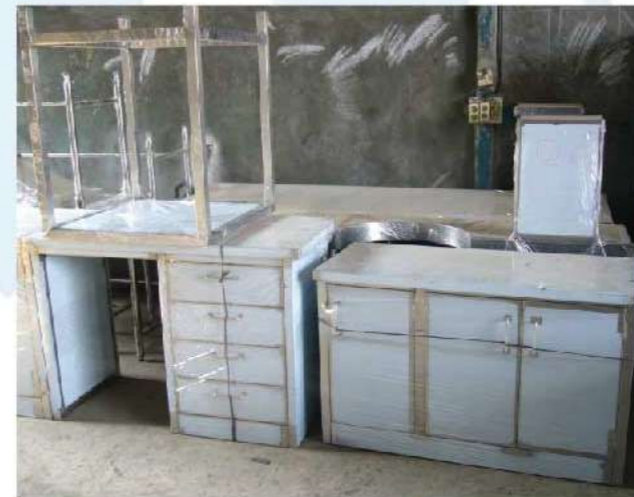
Cabinets & Tables Stainless Steel