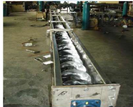
Screw Conveyor Transfer Cocoa