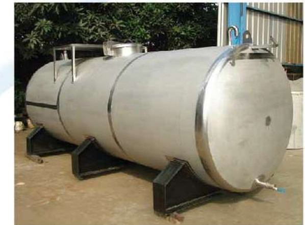
Horizontal Water Storage