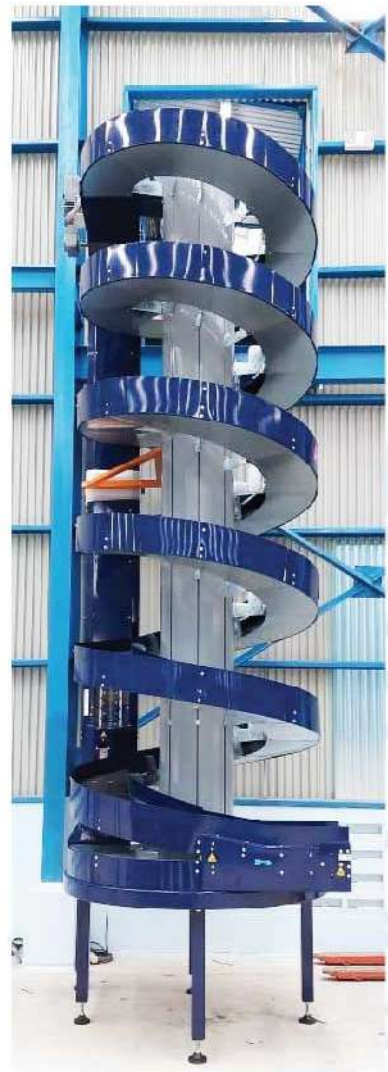
TTC Spiral Conveyor System