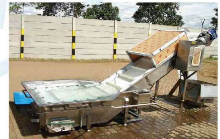
Fruits Or Vegetables Cleaning Inclined Modular Conveyor (With Flight)