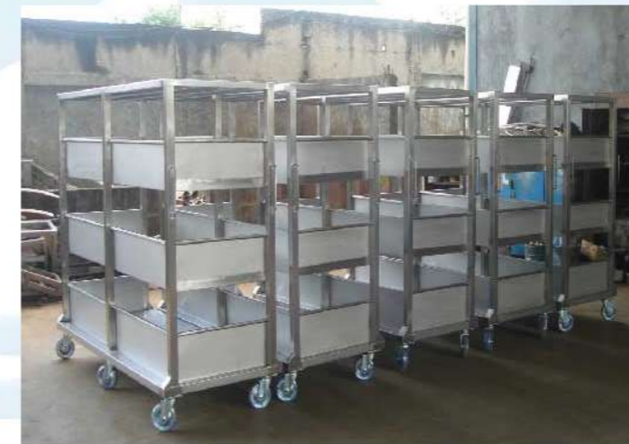
Raw Material Rack Trolleys