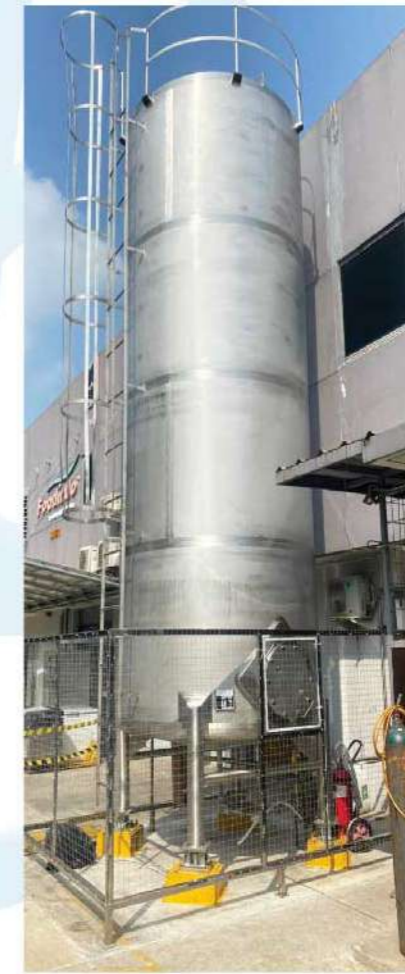
Glucose Storage Tank with Load Cell