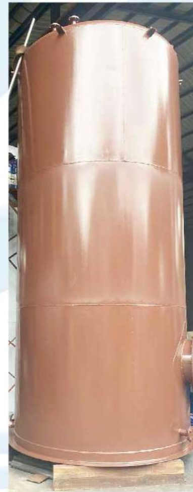
Fuel Storage Tank