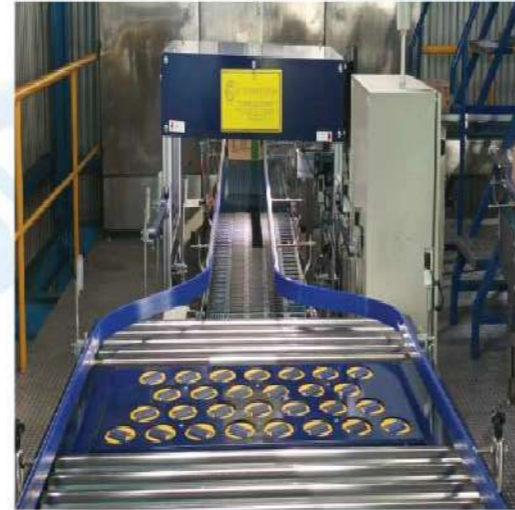
ARB Sorting System With Barcode Reader