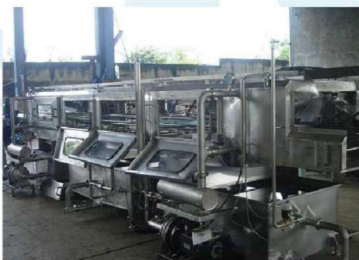
Basket Washing Machine