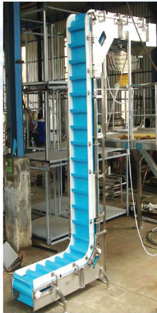
Z - Scoop Flights Thermodrive Inclined Conveyor System