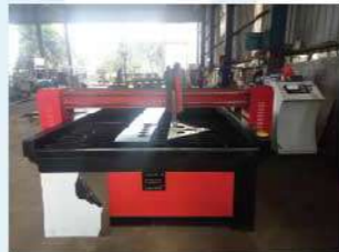
CNC Plasma Cutting