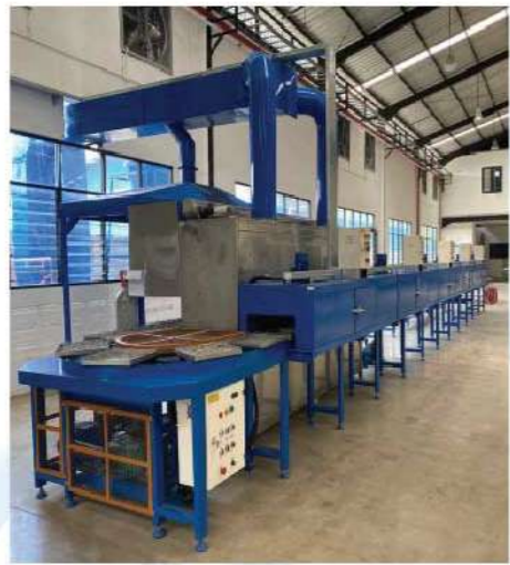
Automatic Spray Booth Chain Conveyor & Drying System