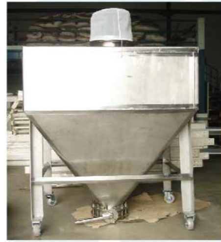
Moveable Flour Transfer Tank