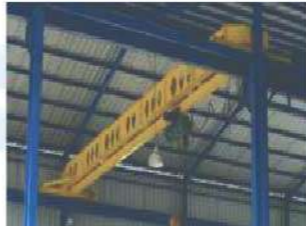
An electric chain hoist enables us to do heavy duty lifting and help us with the moving of heavy machineries or equipments.