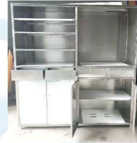
Multi Purpose Cabinet