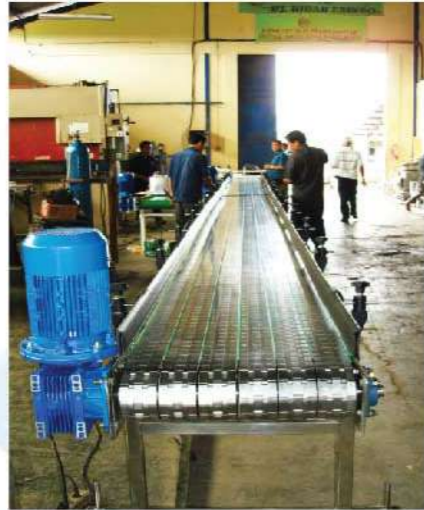
Stainless Steel Table Top Chain Conveyor