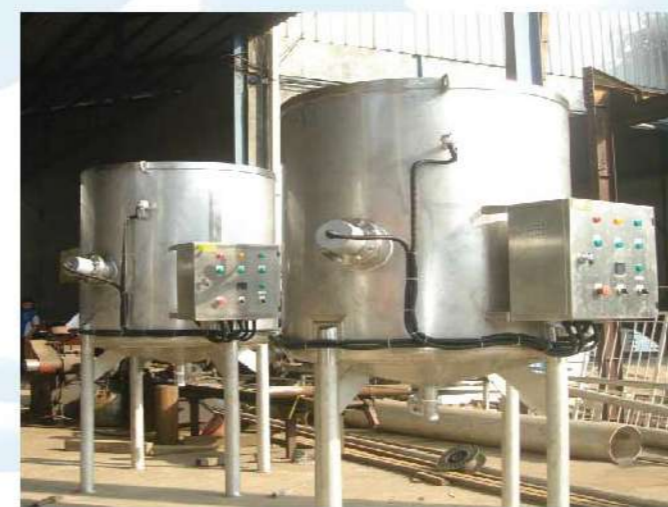
Cooking Tank with Heater