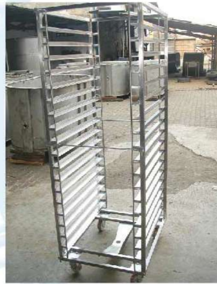
Multi Shelves Trolley