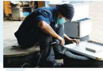
Certified welders are at our hands to produce the best quality products.