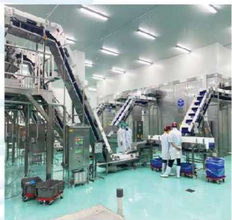
Inclined Multihead Weigher Conveyor System