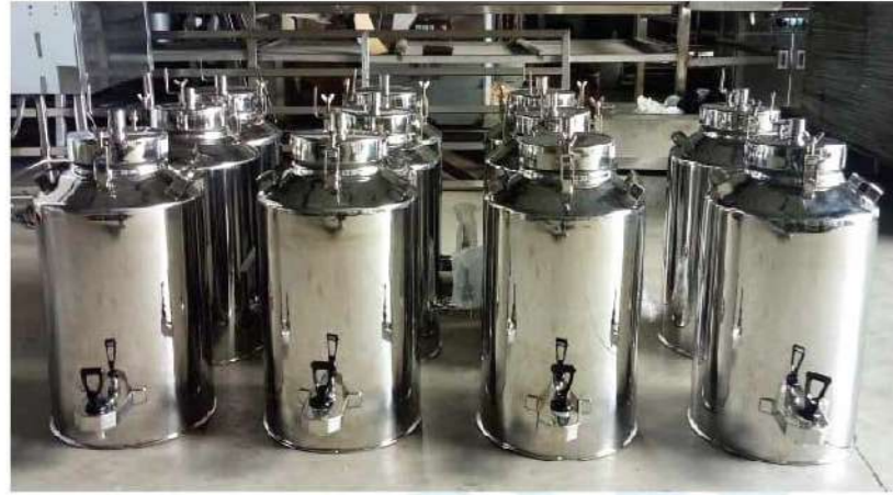
Milk Jar Storage