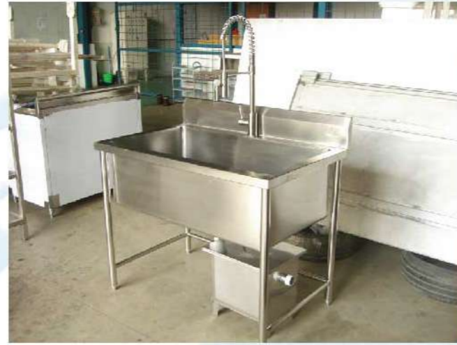
Sink with Grease Trap