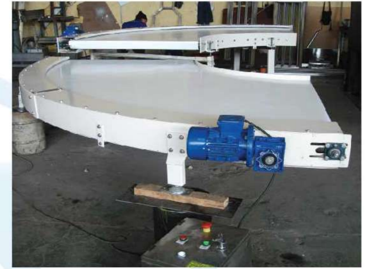
Curve Belt Conveyor Biscuit Transfer