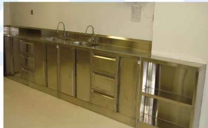
Stainless Steel Cabinets For Laboratory