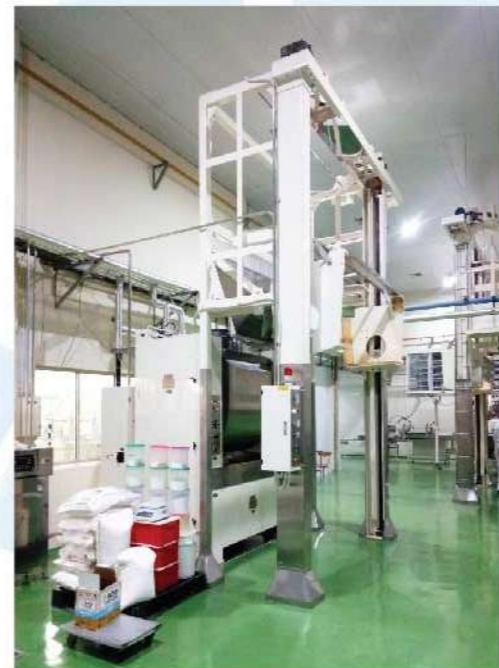
Dough Lifter Machine