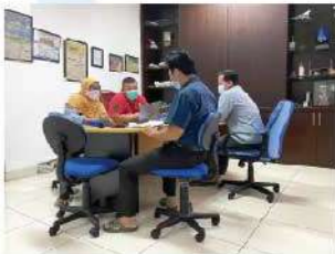
Our professional engineers and staff are at your service for our customers with any problems they encounter or questions that needs to be answered.