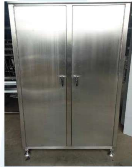
Cabinet Stainless Steel