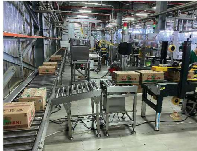
Roller Drive & Weighing Conveyor System