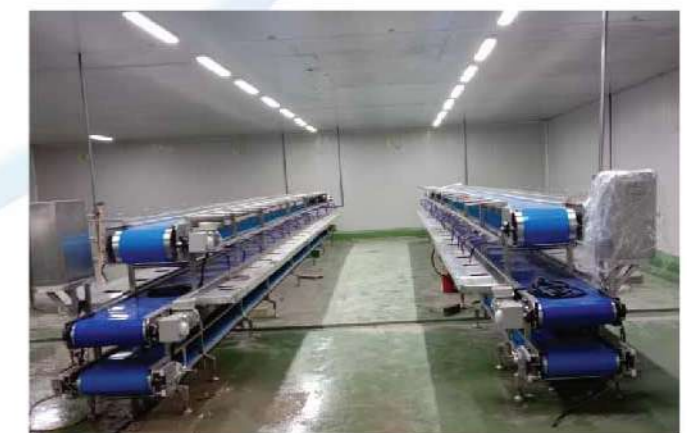
Conveyor Peeling Shrimps Double Deck