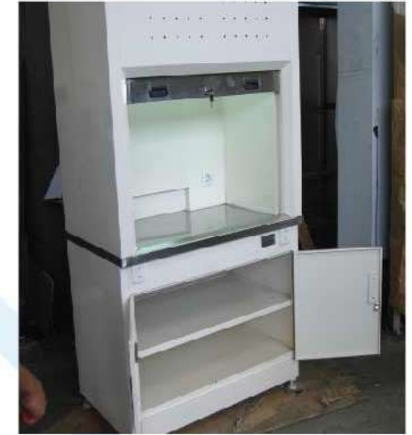
Laboratory Fume Hood