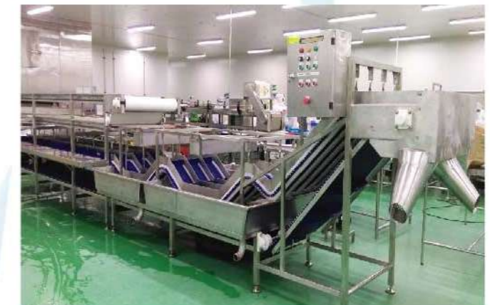
Shrimps Glazing Conveyor