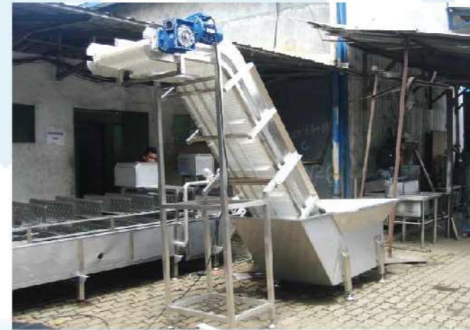
Shrimp Bubble Washing Conveyor