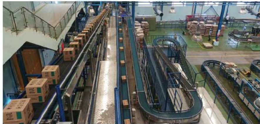
Cartoning Transfer Modular Conveyor System