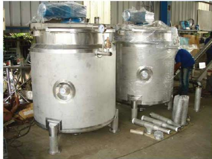
Double Jacket Mixing Tank