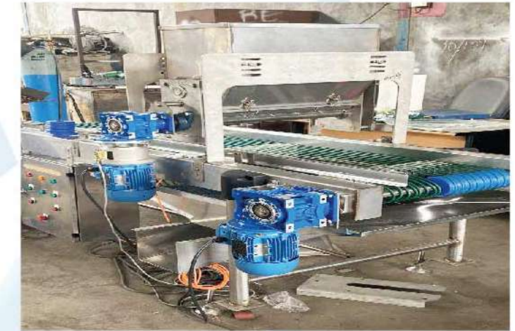
Sprinkle Chocolate Chip Conveyor