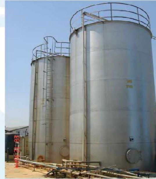
Water Storage Tank