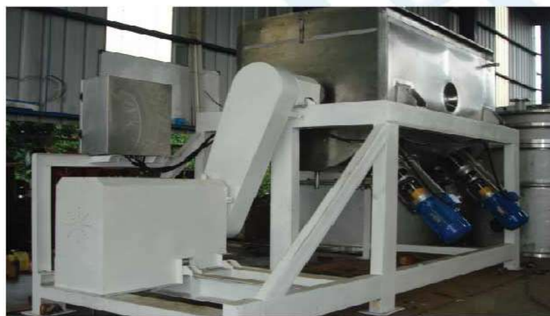
Ribbon Mixer with Chopper