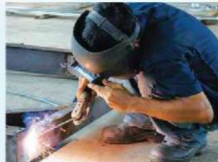
Our quality experience finishing department applies the final touch on our products.