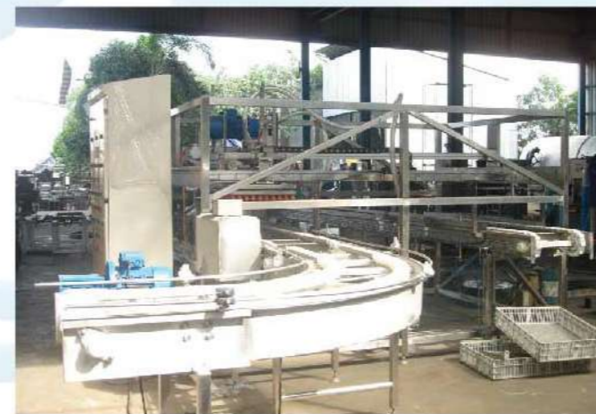
Vaccum Egg Transfer for Poultry