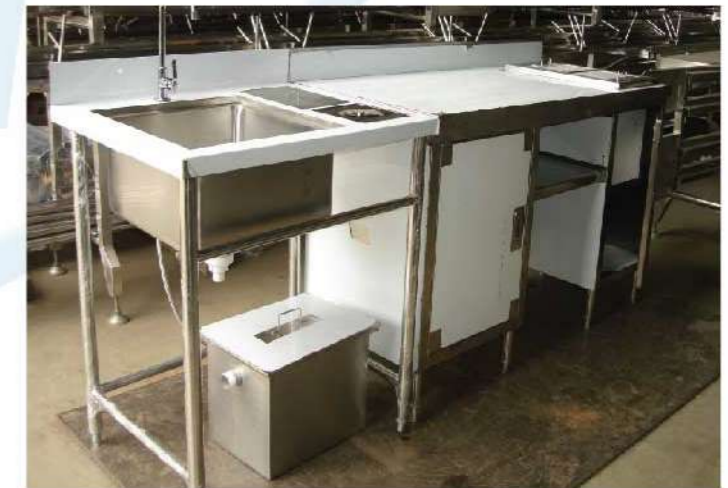
Ice Table & Jug Rinse Washing Table