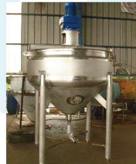
Buffer Mixing Tank