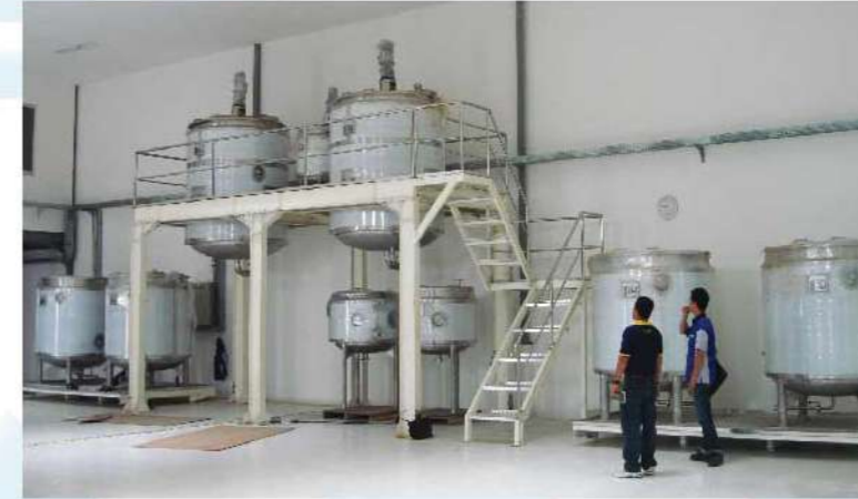
Mixing Double Jacket Tank