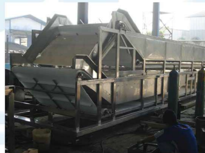
Modular Pasteurize Conveyor Coffee Cup