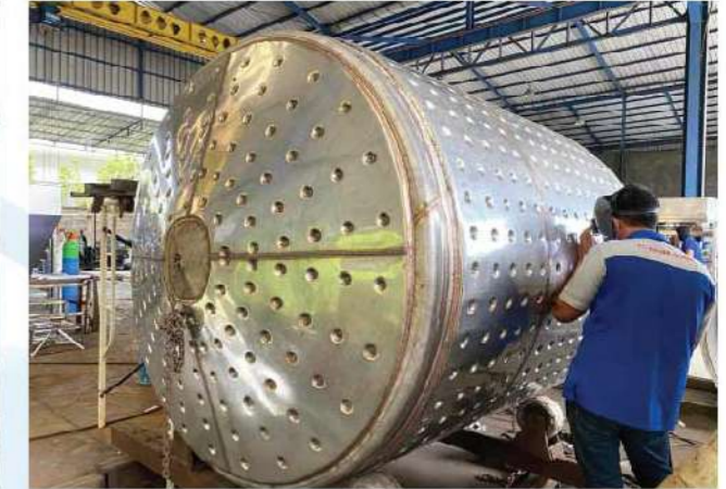
Dimple Jacket Tank