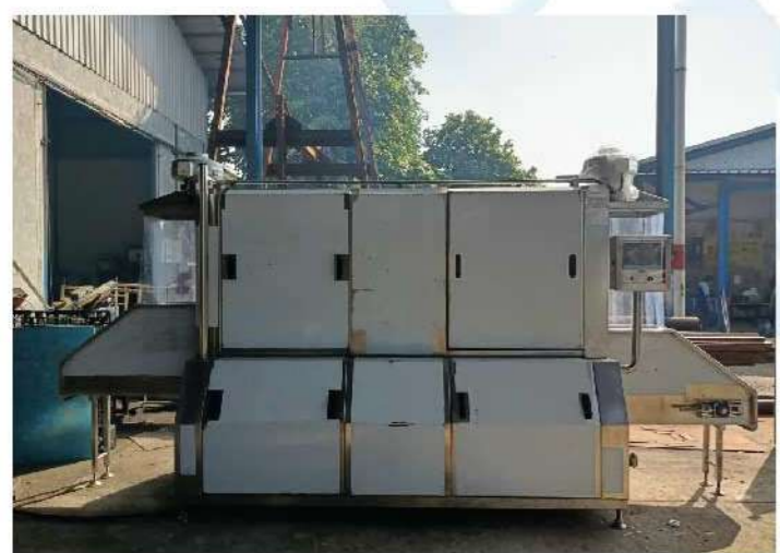
Pallet Washer Machine