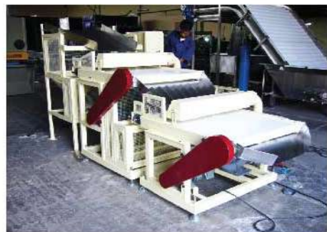
Candy Sorting Machine