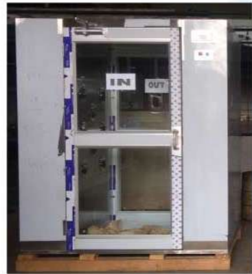
Stainless Steel Interlock System Air Shower