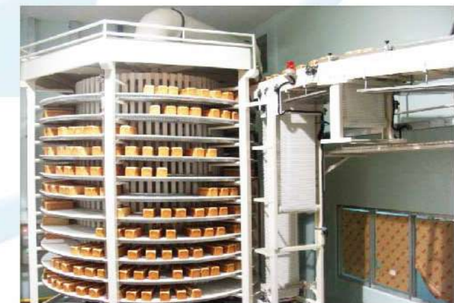
Above Pictures Are PT. Ridar Esindo's Spiral Conveyors That We Manufactured For The Largest Bread Company In Indonesia