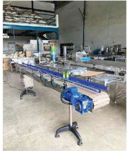
Thermoplastic Table Top Chain Conveyor