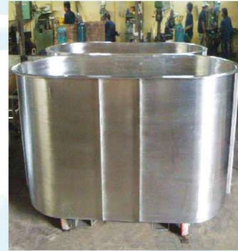
Dough Mixing Cart (Biscuit Production)