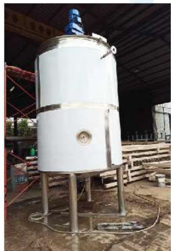
Scrapper Mixing Tank