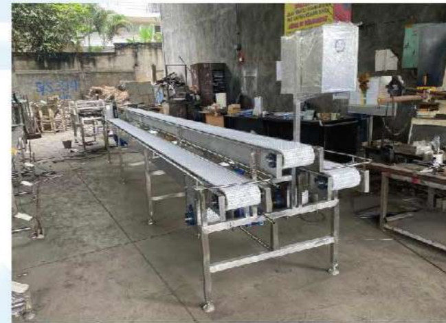
Shrimp Sorting Modular Conveyor