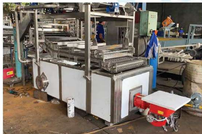
Chicken Frying Conveyor System