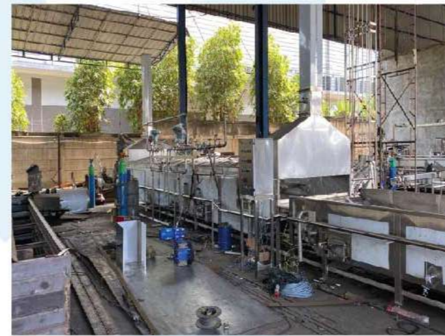
Wire Mesh Pasteurize Conveyor System