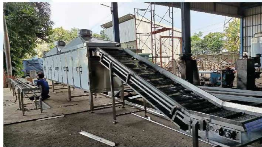
Cooling Conveyor 5 Stages