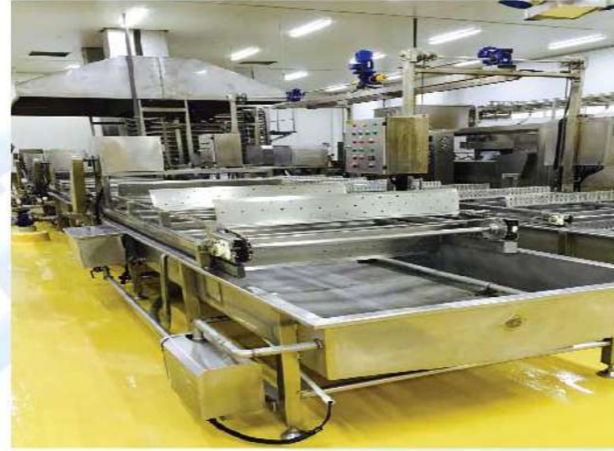
Fishball Cooking Conveyor