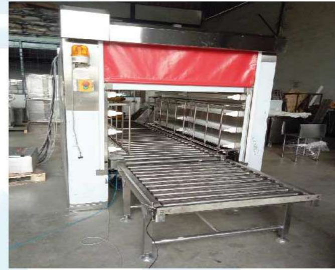
UV Lamp Disinfection Zone Conveyor System