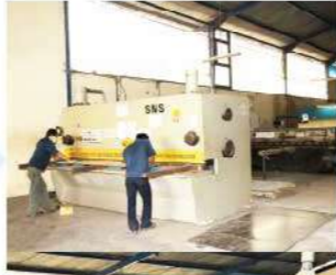
Shearing Machines (Up to 12mm) & Bending Machines (CNC)